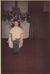
Easter 2003 at Page United Methodist Church