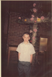
Easter 2003 at Page United Methodist Church